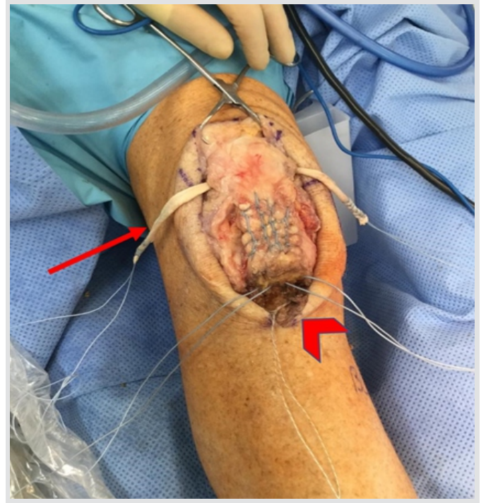
Figure 3: Surgical view, right knee. Chevron demonstrates distal tibial insertion of the patellar tendon demonstrates metallosis after removal of staple. Arrow demonstrates semitendinosus graft passed through the patella.

A #5 FiberWire was used in a modified Krakow fashion exiting in the midportion of the tendon distally. This was repeated on the opposite side providing a four-strand repair. This was vigorously pulled and the tissue was well fixed. Two 4.75 mm suture anchors (SwiveLok, Arthrex Inc., Naples, FL) were placed in the tibial tubercle securing the four-stranded repairs to the tibial tubercle. The knee was held in terminal extension during fixation. This provided a stable repair to 90 degrees without gapping.