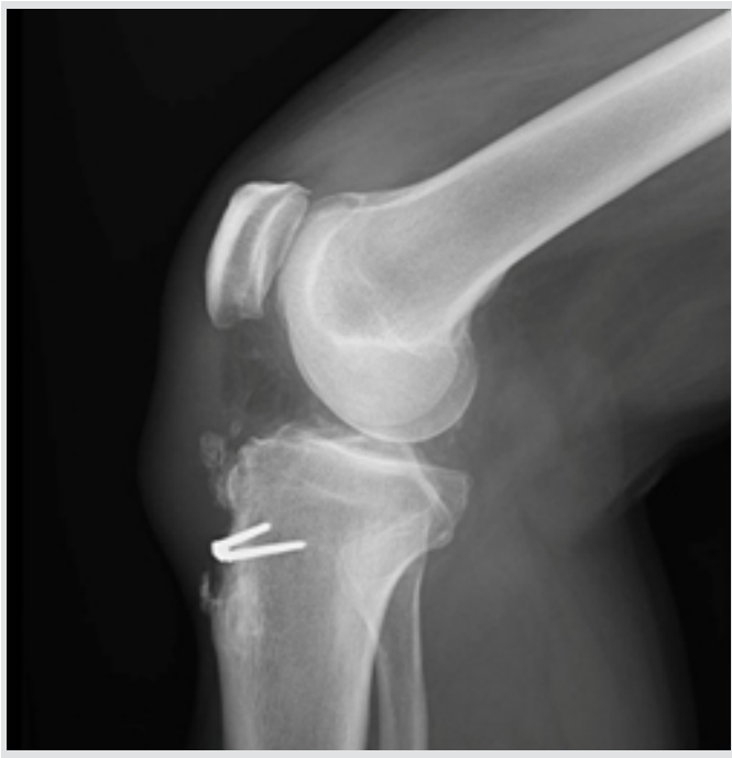
Figure 1: Lateral radiograph, right knee, demonstrating previous hardware, and ossicles at the tibial tubercle consistent with residual Osgood-Schlatter disease.

tibial tubercle in a patient who had undergone a remote procedure for symptomatic Osgood-Schlatter disease.