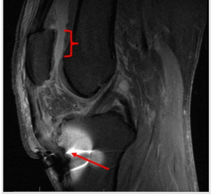
Figure 2: Sagittal magnetic resonance imaging, T2 series, right knee. Arrow demonstrates irregularity and abnormal signal where the patellar tendon inserts distally, metal artifact from staple. No obvious gross disruption of the patellar tendon insertion. Bracket demonstrates mild proximal migration of the patellar leative to the superior chondral margin of the femur.

The patient reported amedical history of gout and surgical history of a procedure performed in young adulthood for symptomatic Osgood-Schlatter disease. While the operative records and reports were unavailable, the patient indicated the procedure included trephination and open debridement of the tubercle with a staple inserted for fixation of the tendon to the remaining tibial tubercle. He further indicated this was conducted after reaching skeletal maturity. The patient reported no history of previous patellar instability or arthrosis to indicate the procedure may have, in fact, been a tibial tubercle osteotomy fixed with staples. He reported the procedure was considered experimental at the time and was specifically for the treatment of patellar tendinopathy.